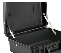
iM-LIDSTAY Supporto per coperchio