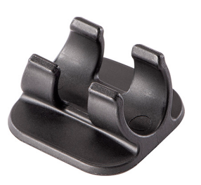
1975H Helmet Light Holder