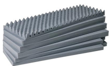
1741 6 pc. Replacement Foam Set