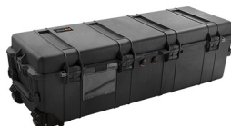
1740NF No Foam