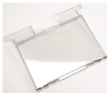
1630DC Document Container Accessory