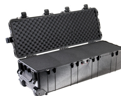
1740WF With Foam