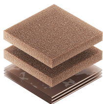
1500CI Corrosion Intercept Kit