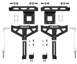
XBEDMT001C Cross-Bed Mount (Ford BoxLink)