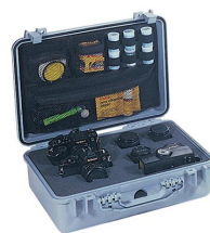
1508 Photographer's Lid Organizer