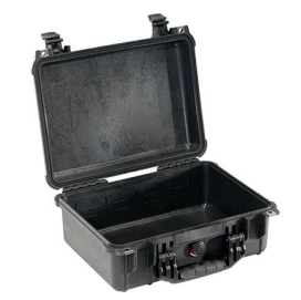
1450NF No Foam