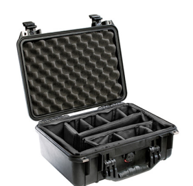
1454 With Padded Dividers