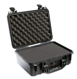
1450WF With Foam