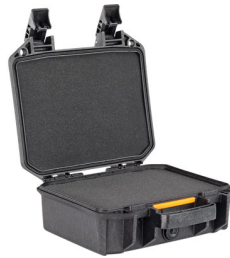
V100WF With Foam