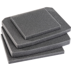
V100FS 4 pc. Replacement Foam Set