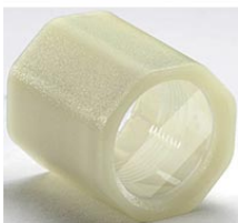
2013PL Photoluminescent Shroud