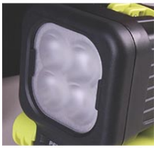
9413DL Diffuser Lens