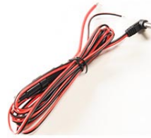
6061F Direct Wiring Rig for Fast Charger