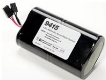
9418 Replacement Battery

23215 Early Ave • Torrance, CA 90505 USA • Phone: (310) 326-4700 • (800) 473-5422 • Fax: (310) 326-3311 sales@pelican.com • www.pelican.com