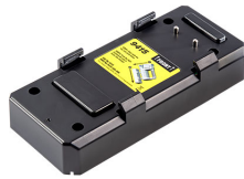
9416 Deck/Dash Charger Base Unit