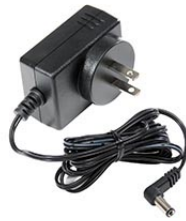
6057F 110V Transformer (USA)