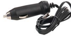
8056F 12v Plug-in for Fast Charger