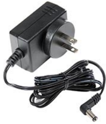
6057F 110V Transformer (USA)