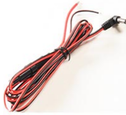
6061F Direct Wiring Rig for Fast Charger