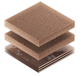
1500CI Corrosion Intercept Kit