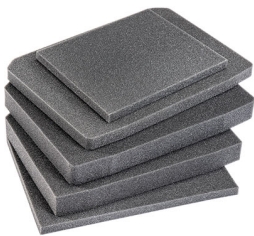
V200FS 4 pc. Replacement Foam Set