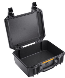
V200NF No Foam