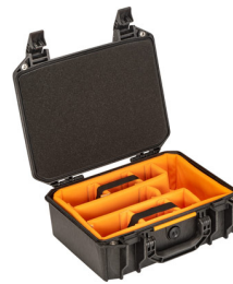
V200WD With Padded Dividers