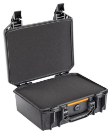
V200WF With Foam