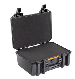
V300WF With Foam