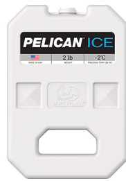
PI-2LB 2lb Ice Pack