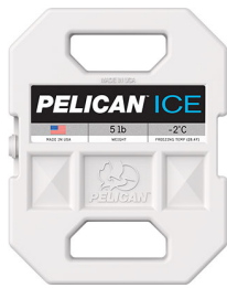
PI-5LB 5lb Ice Pack