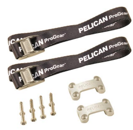
TDKIT Tie Down Kit

23215 Early Ave • Torrance, CA 90505 USA • Phone: (310) 326-4700 • (800) 473-5422 • Fax: (310) 326-3311 sales@pelican.com • www.pelican.com