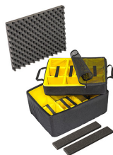
1607AirDS Padded Divider Set