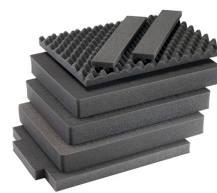
1607AirFS 3 pc. Replacement Foam Set

23215 Early Ave • Torrance, CA 90505 USA • Phone: (310) 326-4700 • (800) 473-5422 • Fax: (310) 326-3311 sales@pelican.com • www.pelican.com