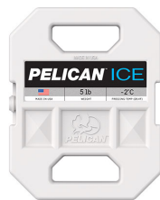
PI-5LB 5lb Ice Pack