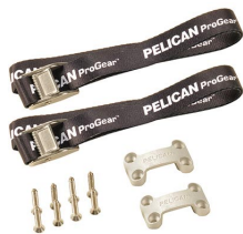
TDKIT Tie Down Kit