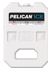
PI-2LB 2lb Ice Pack

23215 Early Ave • Torrance, CA 90505 USA • Phone: (310) 326-4700 • (800) 473-5422 • Fax: (310) 326-3311 sales@pelican.com • www.pelican.com