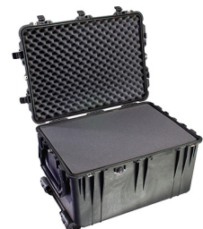
1660WF With Foam