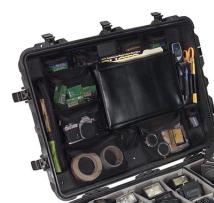
1669 Photo/Lid Organizer