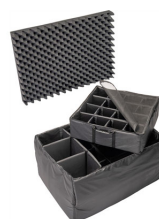
1665 Padded Divider Set