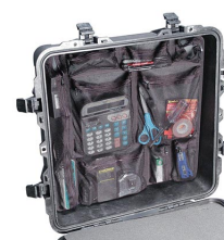
0359 Lid Organizer