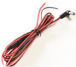
6061F Direct Wiring Rig for Fast Charger