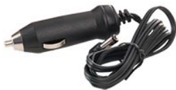
8056F 12v Plug-in for Fast Charger