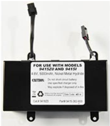
9418Z0 Replacement Battery