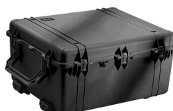
1690NF No Foam