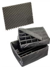
1695 Padded Divider Set