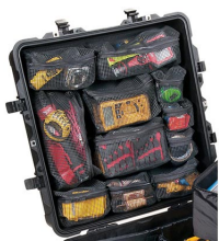
0379 Lid Organizer