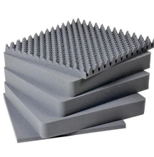
1641 5 pc. Replacement Foam Set