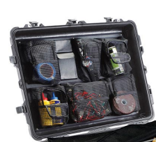
1639 Lid Organizer