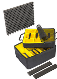
1607AirDS Padded Divider Set