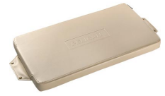
70Q-SEAT-TAN Seat Cushion - Tan