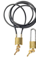
CL2 Cable Lock (2 pack)