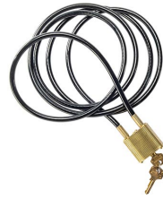
CL1 Cable Lock