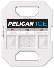
PI-5LB 5lb Ice Pack