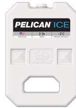
PI-2LB 2lb Ice Pack