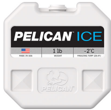
PI-1LB 1lb Ice Pack