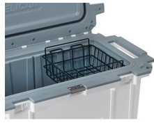
70-WB Dry Rack Basket