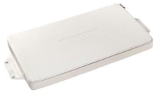
70Q-SEAT-WHT Seat Cushion - White