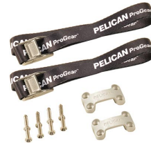
TDKIT Tie Down Kit