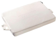
50Q-SEAT-WHT Seat Cushion - White