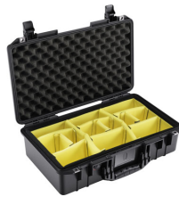
1525WD With Padded Dividers