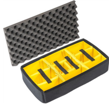
1525AirDS Padded Divider Set