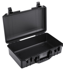
1525NF No Foam