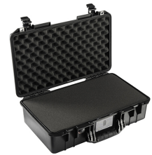
1525WF With Foam