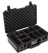
1525TP With TrekPak Divider System