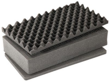
1525AirFS 3 pc. Replacement Foam Set