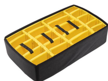
1675 Padded Divider Set