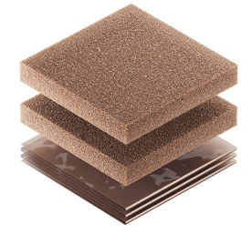
1500CI Corrosion Intercept Kit