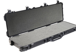
1750WF With Foam