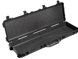
1750NF No Foam