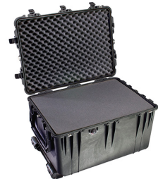
1660WF With Foam