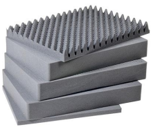
1661 5 pc. Replacement Foam Set