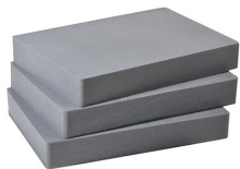
1662 Pick N Pluck™ Sections Only (set of 3)