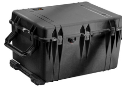
1660NF No Foam