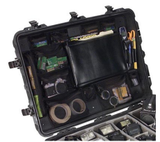
1669 Photo/Lid Organizer