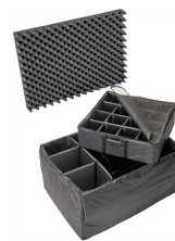
1665 Padded Divider Set