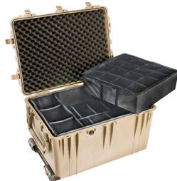
1664 With Padded Dividers