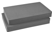
1652 Pick N Pluck™ Sections Only (set of 2)