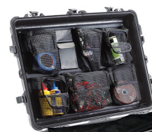
1639 Lid Organizer