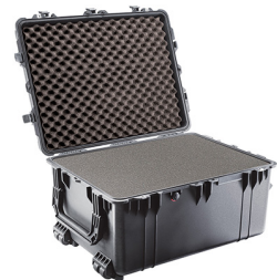
1630WF With Foam