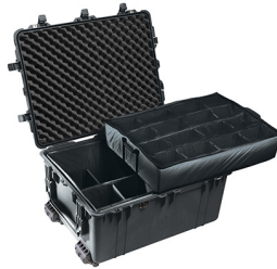
1634 With Padded Dividers