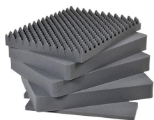
1631 5 pc. Replacement Foam Set