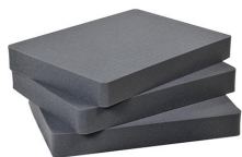
1632 Pick N Pluck™ Sections Only (set of 3)