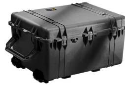
1630NF No Foam