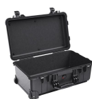
1510NF No Foam