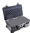
1510WF With Foam