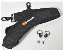
1472 Shoulder Strap