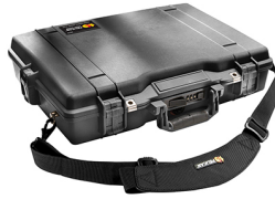
1495NF No Foam