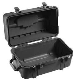
1460NF No Foam