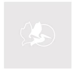
1595WD With Padded Dividers