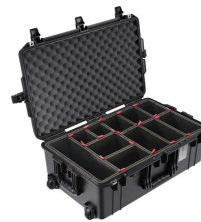
1595TP With TrekPak Divider System