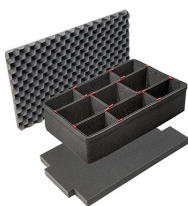
1595TPKIT TrekPak Case Divider Kit