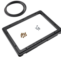
1200PF Special Application Panel Frame