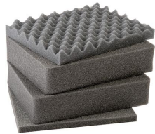
1301 4 pc. Replacement Foam Set