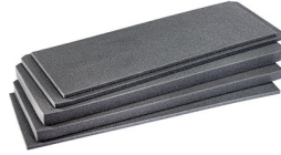
V730FS 4 pc. Replacement Foam Set