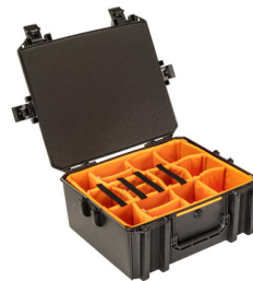
V600WD With Padded Dividers