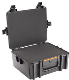
V600WF With Foam