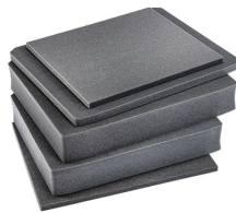
V600FS 4 pc. Replacement Foam Set