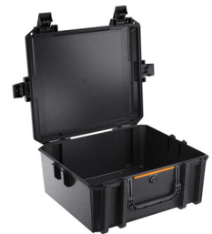
V600NF No Foam