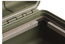
iM29XX-BEZEL Base Bezel Kit