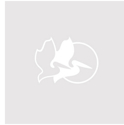
iM2975-X0002 With Padded Dividers