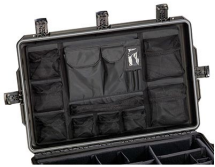
iM29XX-UTILITYORG Utility Organizer