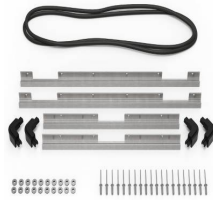
iM2700-BEZEL-LID Lid Bezel Kit