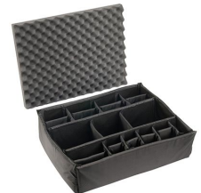
iM2700-DIV Padded Divider Set