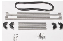
iM2500-BEZEL-LID Lid Bezel Kit