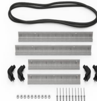
iM2400-BEZEL Base Bezel Kit