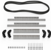
iM2400-BEZEL-LID Base Bezel Kit