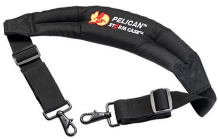
iM2370-STRAP-S Removal Padded Shoulder Strap