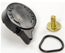
iM-VALVE-M-B Manual Purge Valve