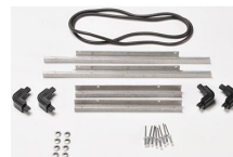
IM2300-BEZEL-LID Lid Bezel Kit