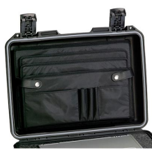
IM2300-LIDORG Lid Organizer