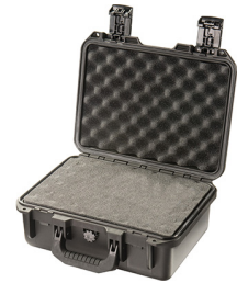
iM2100-X0001 With Foam