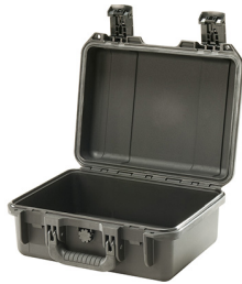
iM2100-X0000 No Foam