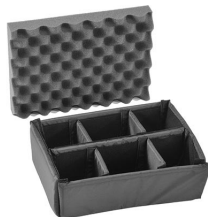
iM2100-DIV Padded Divider Set