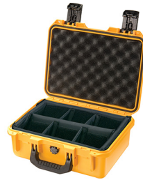
iM2100-X0002 With Padded Dividers