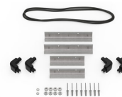
iM20XX-M4-BEZEL Base Bezel Kit (Metric)