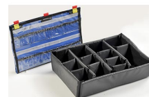
1505EMS EMS Accessory Set (Lid Organizer and Divider Set)