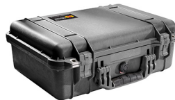
1500NF No Foam