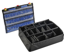
1555EMS EMS Accessory Set (Lid Organizer and Divider Set)