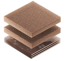
1500CI Corrosion Intercept Kit